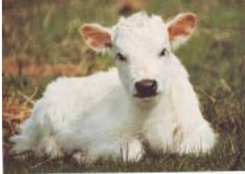
A Chillingham Calf

DNA samples have been prepared from dead animals over the years which have shown that the Wild Cattle are a natural clone. All the cattle are genetically identical due to their very long history of inbreeding. Nowhere on earth are there any mammals more inbred than these cattle, yet they continue to survive and thrive. It is presumed that all harmful genes have been bred out by natural selection. In fact when autopsies are carried out on cattle that die of old age the animals, are mostly free from the usual diseases that plague commercial cattle. The only assistance they receive is hay, fed to them during the winter which is necessary as they are restricted to the 134 hectares of Chillingham