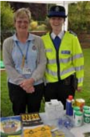
The Police Community Support with numerous 'give away' items to reduce crime