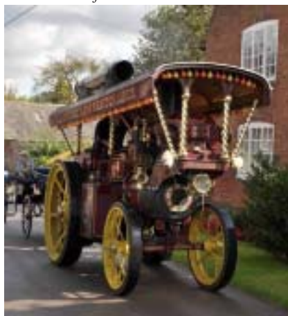
Robin Hood, with trap arriving at the Village Hall