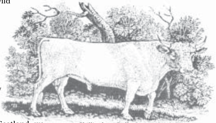
A Chillingham Bull

A few of the cattle stirred, stood up and stretched. The warden told us that the cattle were used to seeing people from a distance but were extremely dangerous if threatened, and would attack any human that got too close. Then as we watched the animals gently grazing and