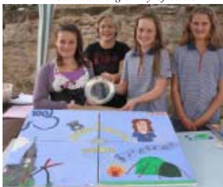
!st Diseworth Guides holding the Diseworth Heritage Trophy