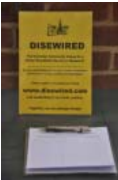
Disewired Information Stand