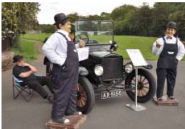
The stunning Model T Ford